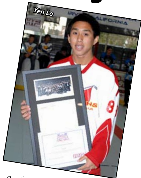
Santiago and Los Alamitos.

The announcers kicked it up a notch as the Varsity Stars were announced to the rink. The lineup included the league's top-ranked players and goalies from each club, including some from the national champion teams of Marina,